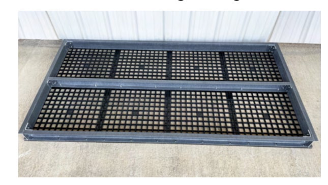
No Leg Frame