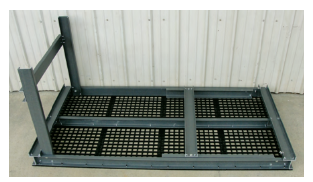
Folding Fiberglass Leg