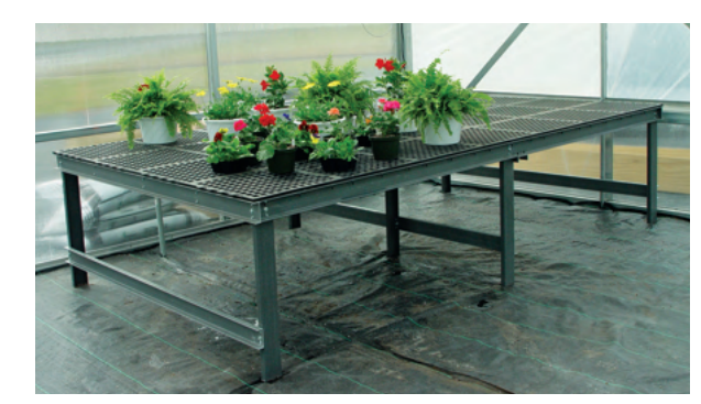
Fixed Fiberglass Leg