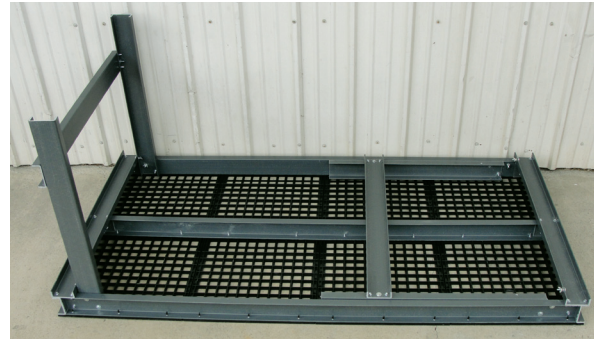
Folding Fiberglass Leg