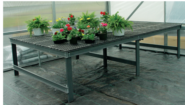
Fixed Fiberglass Leg